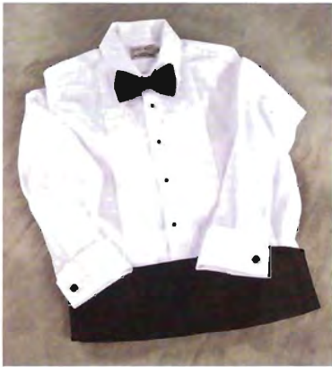
White Pleated Tuxedo Shirt with a Straight Collar With Studs and Cuff Links