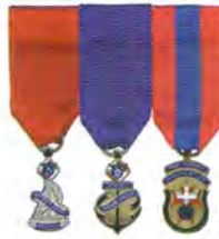
Diagram 2 Former District Deputy Past Grand Knight Past Faithful Navigator