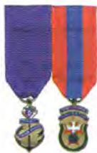
Diagram 2 Past Grand Knight Past Faithful Navigator