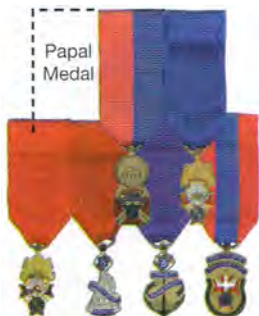
Diagram 7 Papal Medal Past State Deputy Former Vice Supreme Master Former District Master Former District Deputy Past Grand Knight Past Faithful Navigator