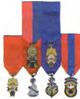
Diagram 6 Past State Deputy Former Vice Supreme Master Former District Master Former District Deputy Past Grand Knight Past Faithful Navigator