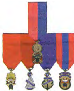
Diagram 5 Past State Deputy Former District Master Former District Deputy Past Grand Knight Past Faithful Navigator