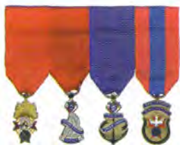
Diagram 4 Former District Master Former District Deputy Past Grand Knight Past Faithful Navigator